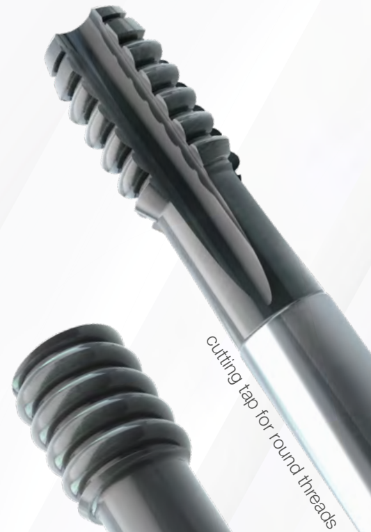
cutting tap for round threads

To achieve this, special roll taps are used to smooth the thread, especially after chipping processes such as thread milling or tapping.