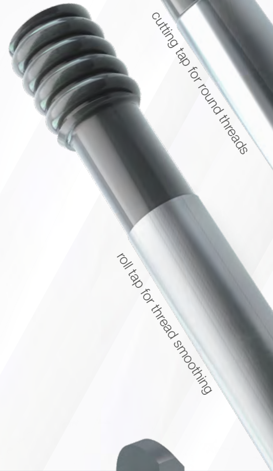
roll tap for thread smoothing